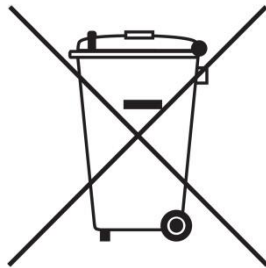
Figure 1: Obligatory labelling: the collection symbol for batteries.

The directive prescribes an additional label to the CE marking. All batteries, accumulators and battery packs are required to be marked with the separate collection symbol (crossed-out wheeled bin) either on the battery or its packaging depending on size. In if the battery contains more heavy metals than prescribed (see below), their chemical symbols have to be added.